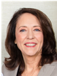
Maria Cantwell (Prefers Democratic Party)

Elected Experience: U.S. Senate 2001-present, U.S. House of Representatives 1993-1995, Washington State Legislature 1987-1993.