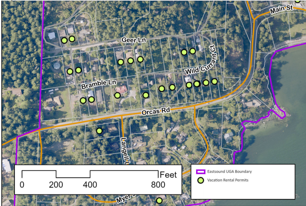
Map 1. Vacation Rental Permits in Southwest Eastsound.

The higher density in UGA neighborhoods can exacerbate the negative affects vacation rentals might have on neighbors. First, having homes closer together can increase impacts because the land use is physically closer to other residential uses. Furthermore, denser residential development can result in more vacation rental permits per acre than what normally occurs outside of the UGAs. A common complaint about vacation rentals is that neighborhoods can be 'taken over' by vacation rentals. Map 1 below shows one neighborhood in Eastsound, north of Orcas Road in the southwest corner of the UGA that illustrates neighborhood saturation. The achieved density in this neighborhood is roughly four dwelling units per acre. This neighborhood is designated Eastsound Residential with a density of 2 dwellings per acre.