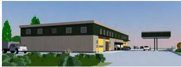
Rendering of the planned Public Works facility.

The Beaverton Valley facility will replace the Guard Street shop, in use since the 1940s, with a modern shop facility for maintenance and equipment crews. The site will also include a fuel station for