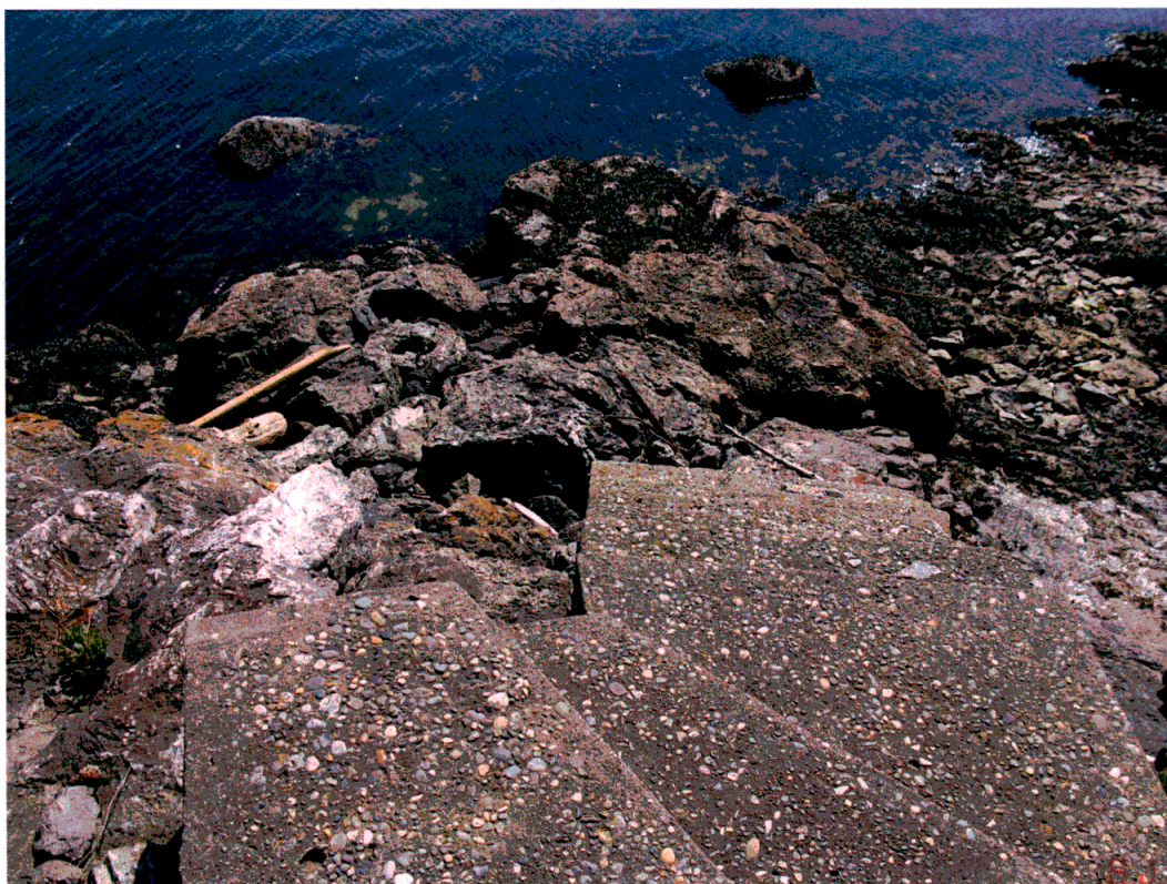
Shoreline at zero tide. Steps leading to beach. This is not forage fish habitat. No eelgrass or bull-kelp present. Very rocky substrate. No pocket beaches in ownership area of shoreline (circa April 21, 2012).