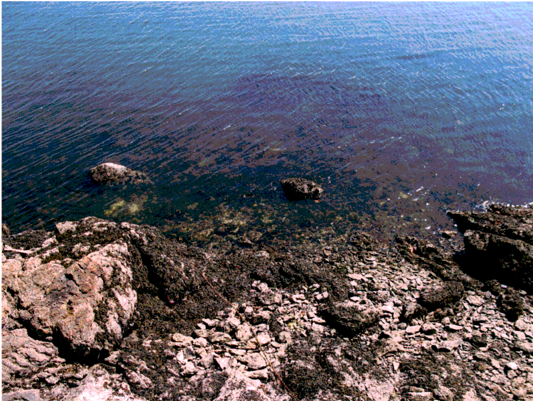
View of shoreline at zero tide. Shallows are inundated with Sarcassum muticum . No eelgrass or bull kelp present along shoreline of parcel. (circa April 21, 2012). This is not forage fish habitat.