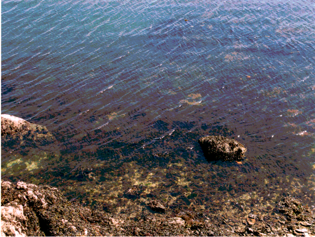
View of shoreline at zero tide. Shallows are inundated with Sarcassum muticum . No eelgrass or bull kelp present along shoreline of parcel. (circa April 21, 2012).