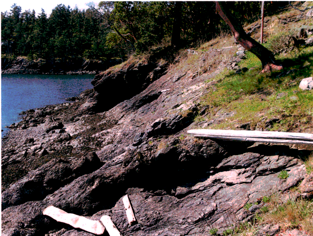
View west from house. No evidence of palustrine emergent wetland as indicated on Report Map 19 (circa April 21, 2012).