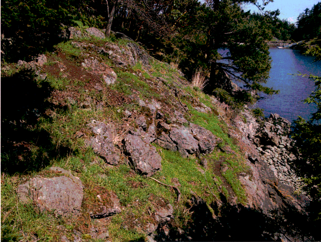
View north from house towards reach boundary with reach 31. Garry Oak and Rocky Mountain Juniper species present. No evidence of palustrine emergent wetland as indicated on Map 19 (circa April 21, 2012).