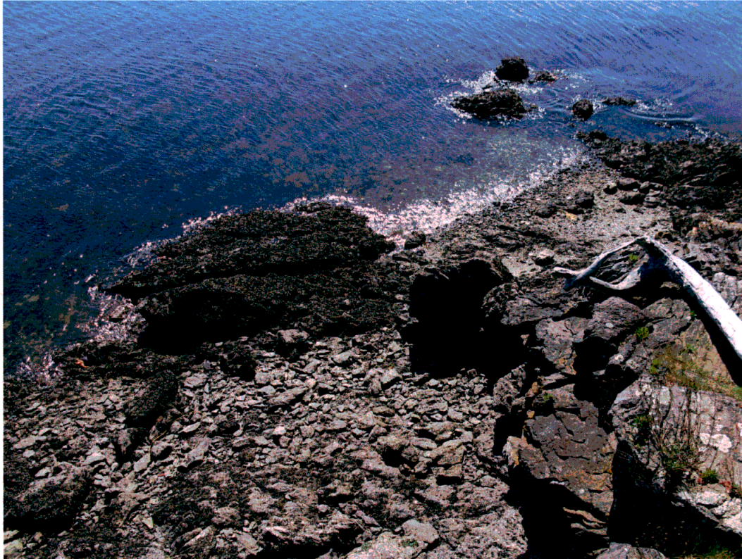
Shoreline at zero tide—very rocky substrate. This is not forage fish habitat. No eelgrass or bull-kelp present. Abundance of Sargassum muticum in shallows. No pocket beaches. (circa April 21, 2012).