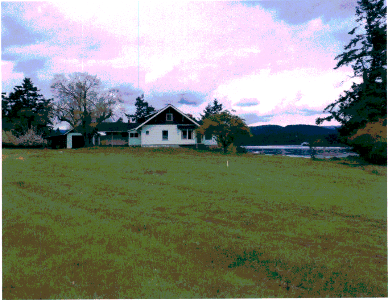
Photo taken from waterfront common area on lot #3 looking north to lot #2.