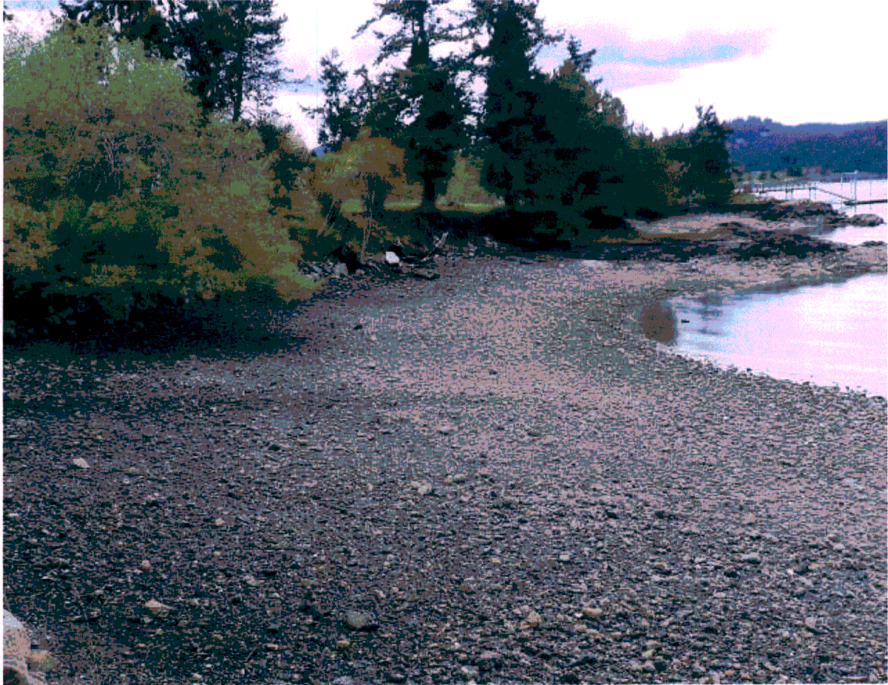
Photo taken from lot #4 waterfront common area looking north all the way to the community dock on lot #1 of Blind Bay Estates