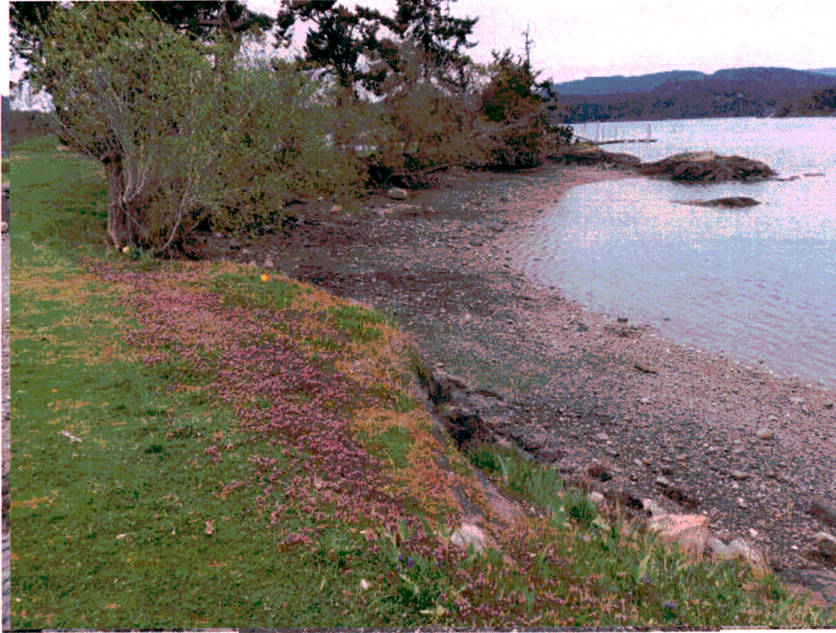
Lot #2-Common area waterfront in front of the original farmhouse that was built in the 1920s.