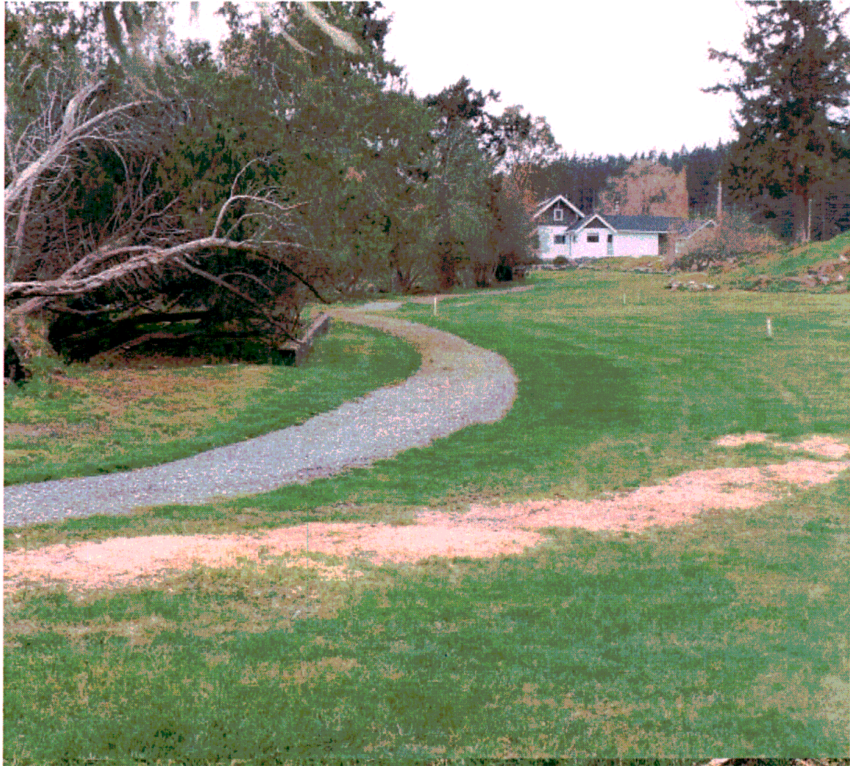
Lot #1 common area gravel path– Farmhouse on lot #2 in background.