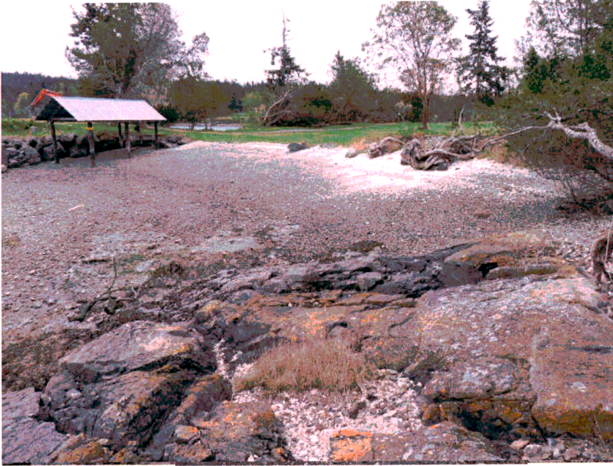
Lot #1-North beach with boat house.