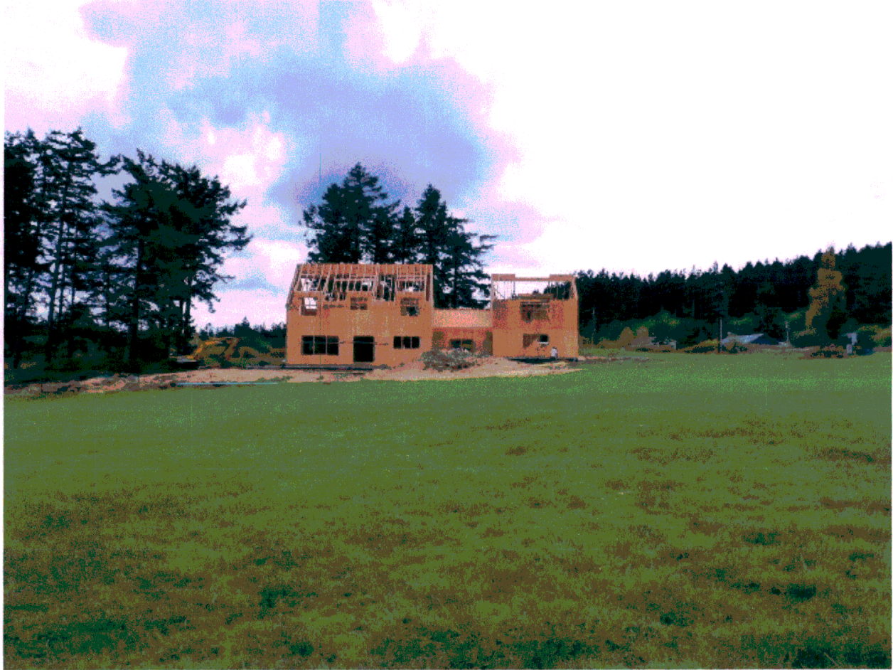
New construction on lot #4 Blind Bay Estates. Photo was taken from the waterfront common area on lot #3