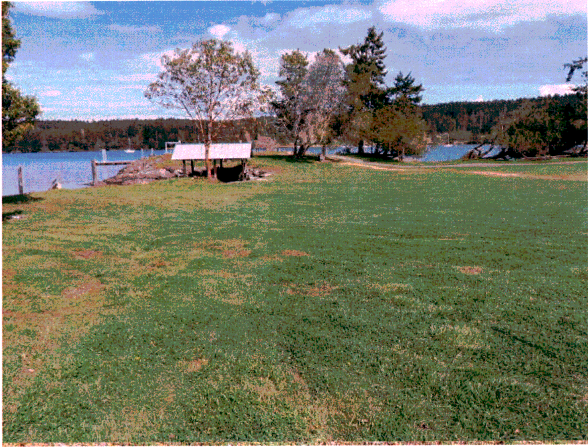
Lot #1 Blind Bay Estates– View to northeast– boat house with dock in the background.