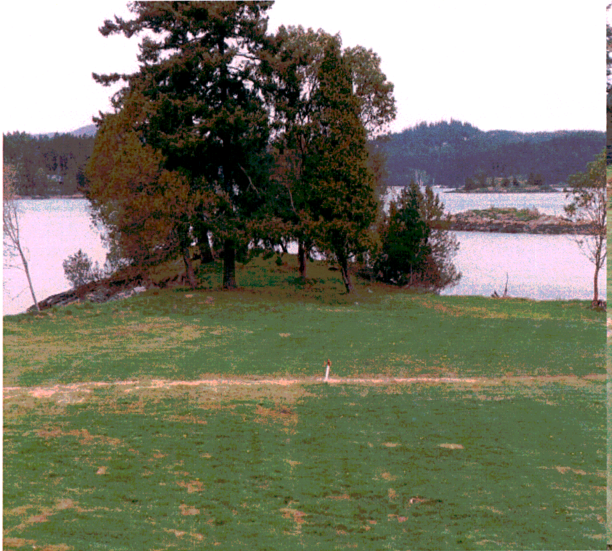
Lot #1 looking north to point with fire pit.