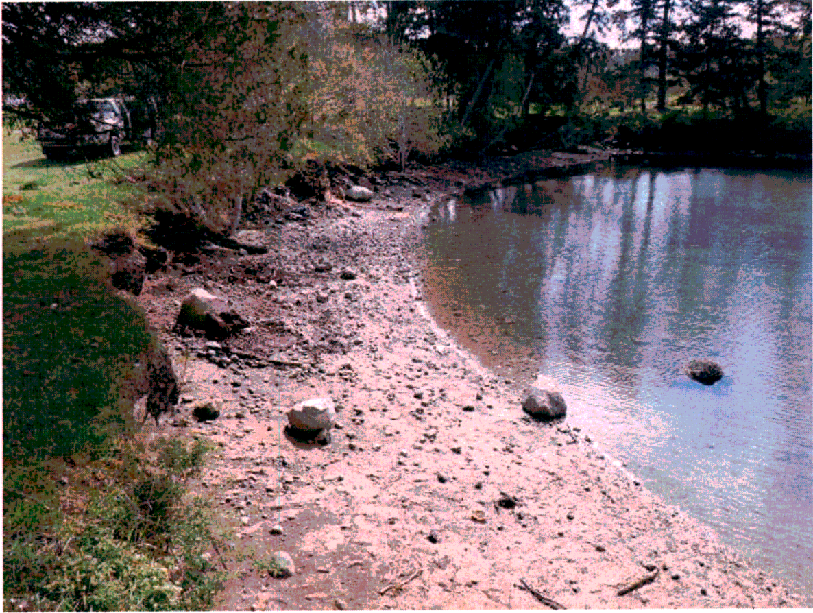
Lot #1 Blind Bay Estates– northwest bay