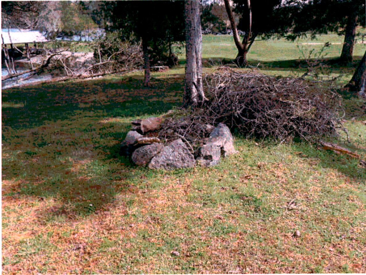
Lot #1 Blind Bay Estates– Picnic Point fire pit. Was on the property before purchase in June of 2006.