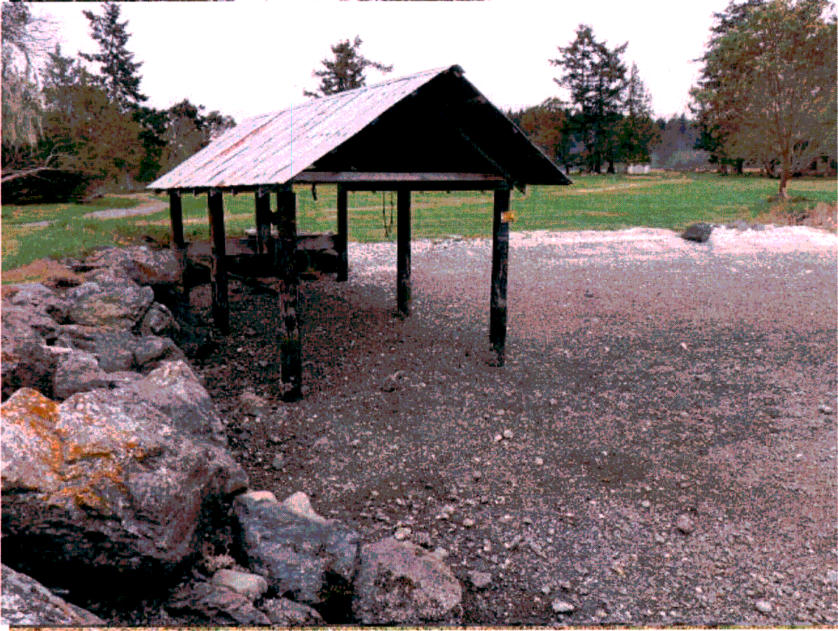
Lot #1– Boat house– no one knows the age of this boat house, needless to say it has been a part of this beach for a long time.