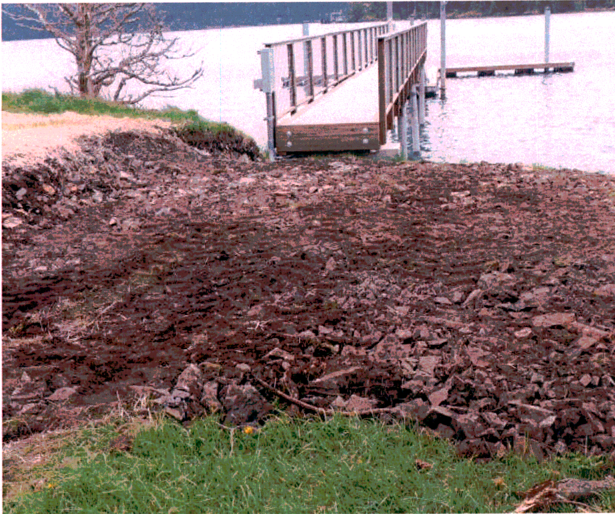
Lot #1 common area at the dock. This is the transition area where the fixed pier will join the shoreline.