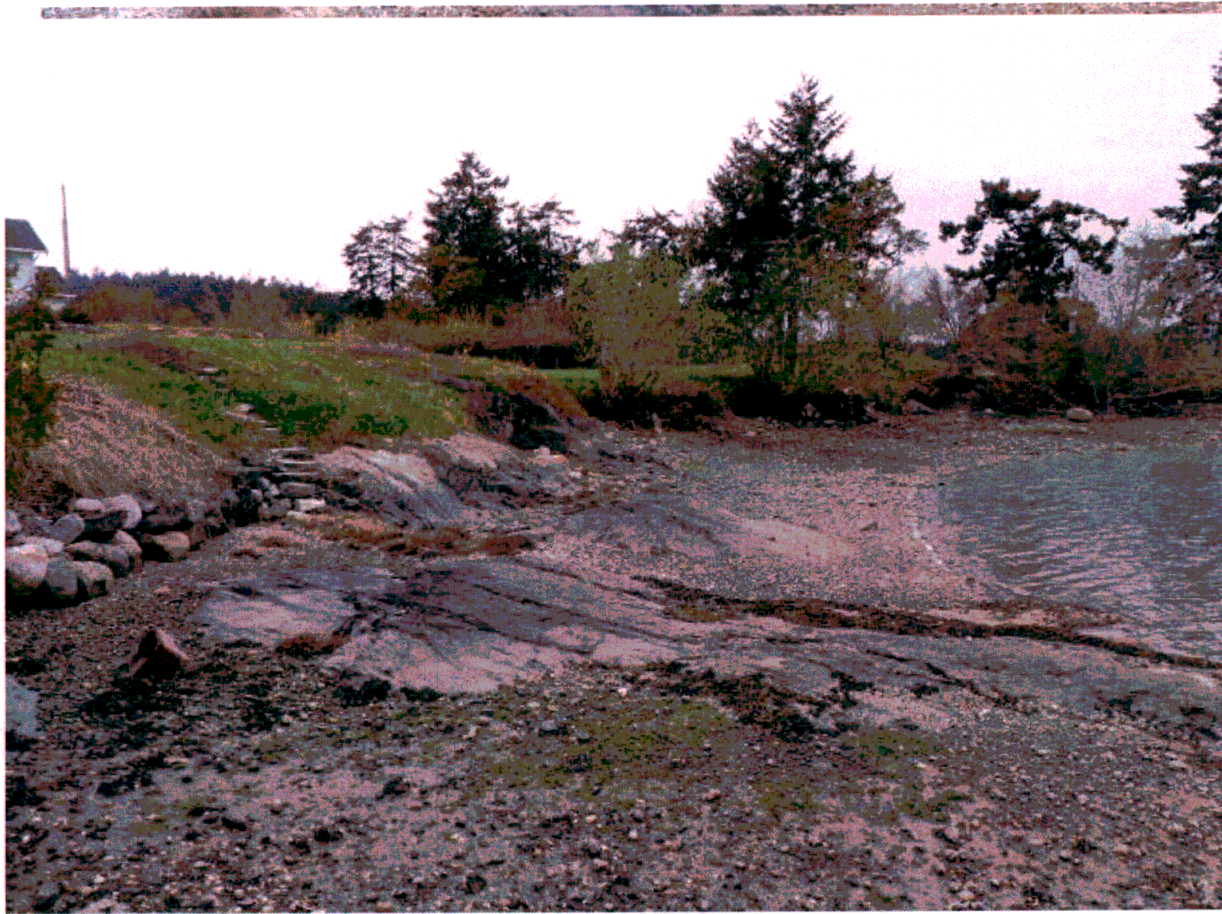
Lot #2-Steps to the beach. Common area waterfront in front of the original farmhouse.