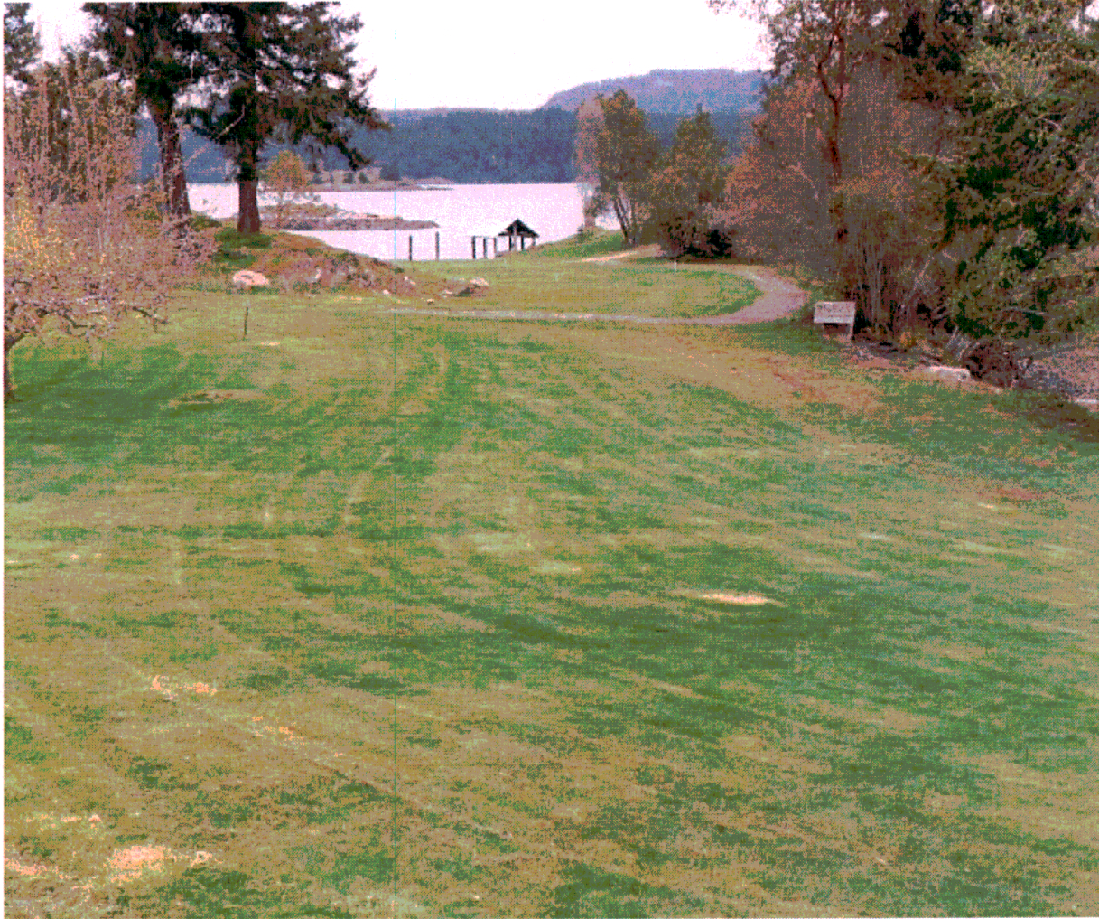
Picture taken from Lot #2 from the farmhouse looking north across to Lot #1 to the boat house and the two pilings in front of it. Also in the photos is the walkway that was part of the short plat requirement