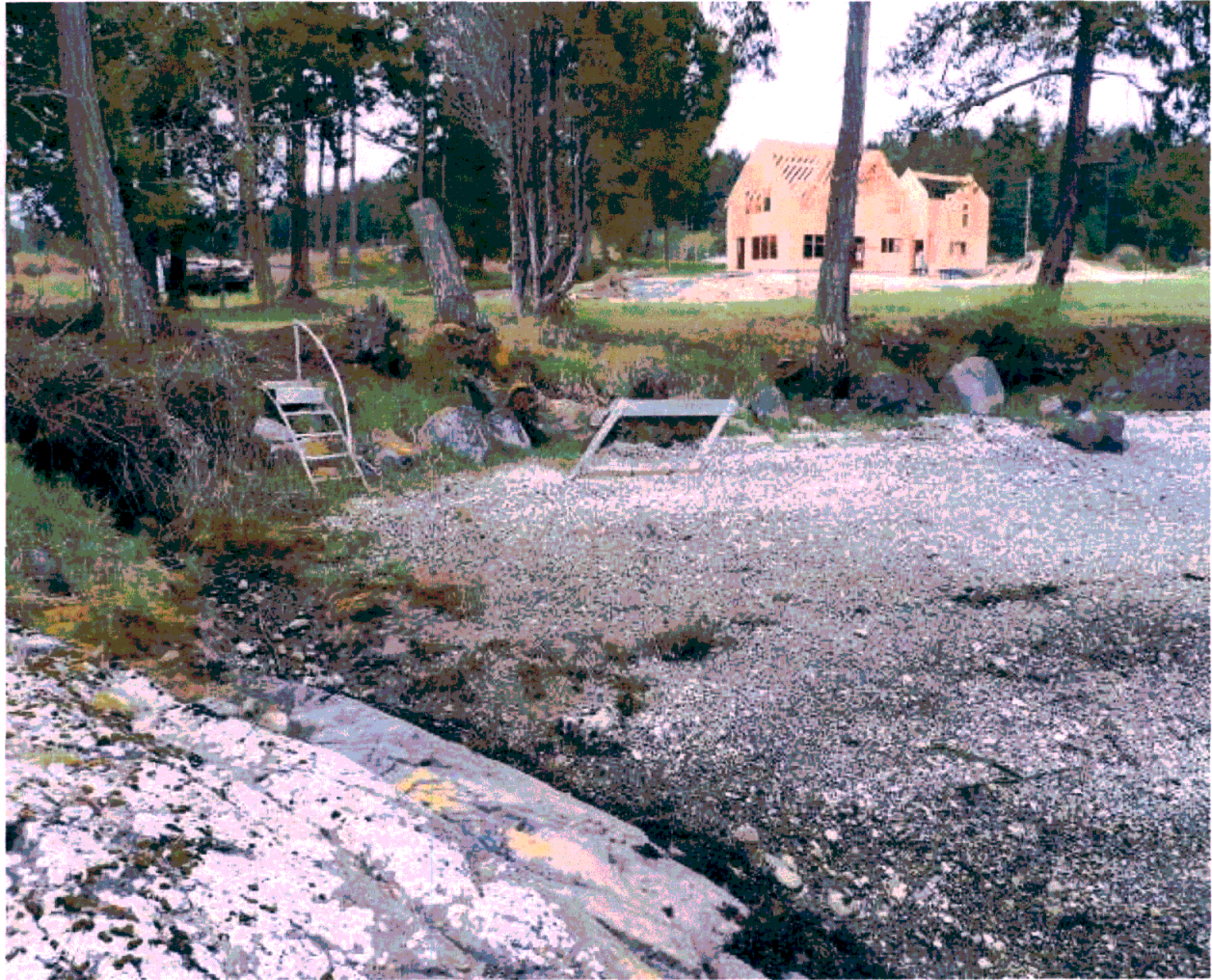
Photo taken from barge ramp on lot #4 common area looking back at the new construction. Stairs to beach in foreground.